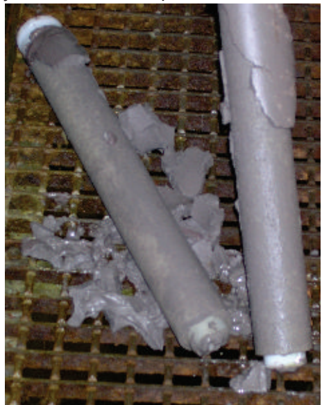
When the filter clogged up within a few hours with a grey mud like material we knew that something was happening.

We started off by purchasing a suitable filter that can handle the acid that you use in the plant. This should be preferably an easy one to clean as you need to clean it often; in our case daily. We settled on an in-tank filtration system featuring a quick-change car-